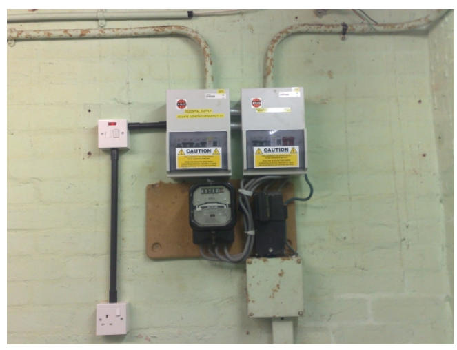
The new modern distribution boards kindly donated by Wilts Electrical

We can report that this work has now been completed and the repeater equipment is now finally in a clean & dry room. Members may not be aware that the site actually has two rooms. Adjacent to the room that houses the repeater is a room that's home to the standby generator, switchgear, battery charger and mains distribution boxes.