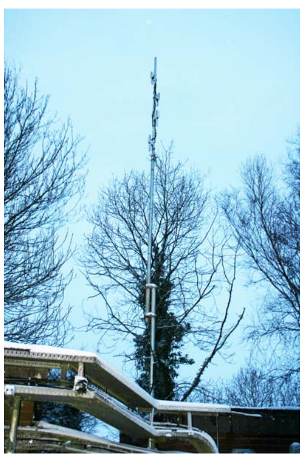
Temporary antenna system at its full height

Once the repeater had been closed down and moved to its new home it was only a matter of hours until it was back on the air again. As already mentioned, we could only operate on a temporary antenna system which was at most only 10 feet off the ground and heavily shielded all around by either high trees or buildings. Coverage at this time turned out to be terrible, worse than we had ever expected, even from this temporary setup.