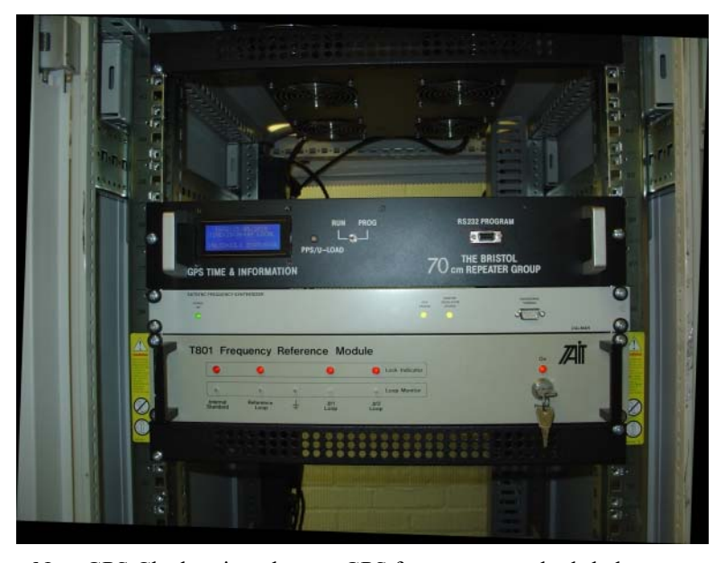
New GPS Clock unit at the top, GPS frequency standards below

Several weeks after the antenna installation we moved the repeater equipment out of its small cabinet and into the new rack which has been rewired and connected up to the backup generator supply. At the same time we installed the new GPS Clock unit that Mat had been designing and building over the winter which would keep the repeaters logic (RC-210) time management synchronised with real time. During this installation we had also to upgrade the RC-210 logic with new versions of firmware and a modified configuration. This was to remove some long standing bugs and switch the GPS clock to auto local time rather than fixed to UTC.