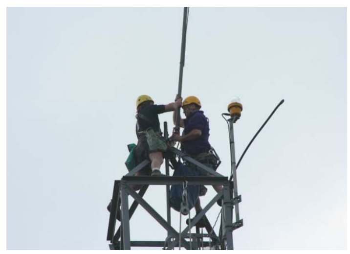
Old antenna being removed from the top of the tower.

It was found that an existing antenna located at the very top of the tower was in fact redundant and its feeder already removed. We quickly got permission to remove the old antenna and mount our antenna on the top of the tower provided everything checked out ok with the riggers when they got on site. This in it self would make the installation simpler and quicker as there was now no need for any stand-off or supporting steel work.