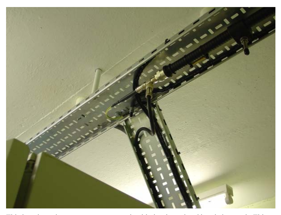
This is a shorted quarter wave co-ax stub with the shorted end bonded to earth. This should help keep noise, rain / storm static and any lightening discharges from building up on the feeder and possibly discharging into the Tx/Rx units.

Moving the repeater to the new rack also required us to complete some earth bonding and installing a lightening arrester to the main antenna feeder line.