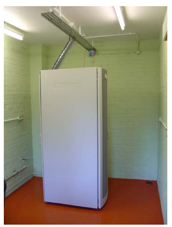
The shiny new floor, cabinet and tray work

Over the remaining winter months and into the early spring of 2010 we concentrated on preparing the main comms room of the site which would permanently house the repeater equipment (BS was operating from a temporary position within the Generator room). The comms room was completely gutted; walls floor and ceiling were all scraped and cleaned.