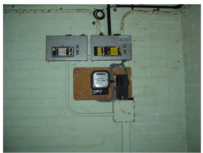
The Original Electrical distribution board.

These last 12 months seem to of flown bye and so much work has been done, both to the site itself and moving the BS equipment into its new home. As was mentioned in our last newsletter (which went out shortly after we secured the new site), we had to quickly carry out essential building repairs. Stripping and replacing a new flat roof to stop water ingress, clear out materials left by the previous occupier. Then rewire the sites mains electrical supply bringing it in line with the 17<sup>th</sup> edition of the wiring regulations, before cleaning and painting the walls, ceiling and floor.