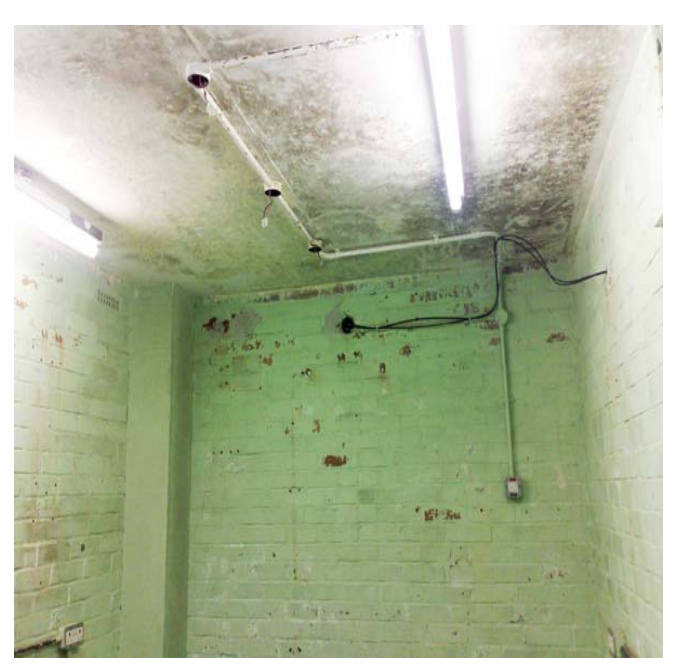
Comms room just after we took ownership

Well, looking back over the last year and now writing this newsletter it does seems more like working on a DIY Publication than a repeater newsletter. However, we do hope it will give an indication of all the work that's been going on since the last newsletter and our move to Lansdown.